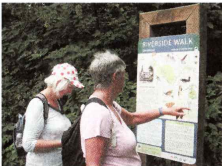
The Horsham Riverside Walk

Our Executive Committee is elected by our membership and meets monthly to consider all aspects of our town. We have sub-committees who focus on planning, membership and new initiatives, and we are all volunteers.