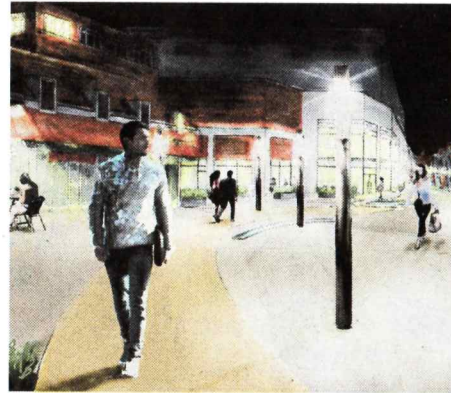
An artist's impression of a light stack, one of the ideas for town centre improvements.

However, it is 97 pages long and that doesn't include the associated documents detailing the responses to earlier consultation. It contains many facts and figures with some interesting suggestions for the town's future. A lot of research