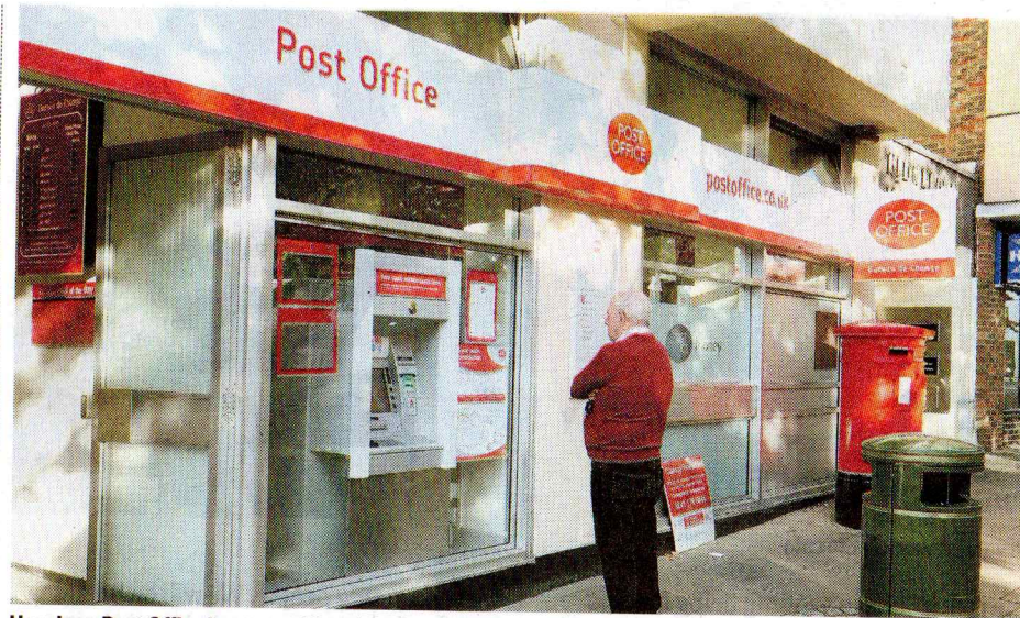
Horsham Post Office has moved from the Carfax.

These terms have prompted us to consider a sore lack here in Horsham. We all have seen how the town's shops are