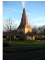
2. A new church with roof shingles to replace one lost in Horsham town centre.