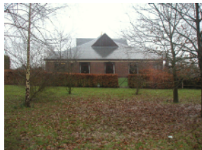
7. Another community facility close to the new church.