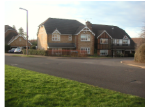
8. Large modern luxury homes of traditional styles and appearance.