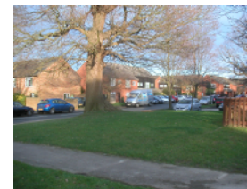
9. An area of more "affordable" housing in the Holbrook Ward.