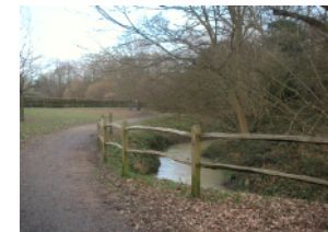
10. Part of Horsham's Riverside Walk with river in full flow; but where is it?