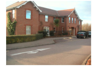
4. A new doctors' surgery for a new community.