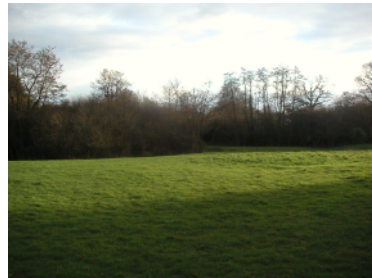
5. The site of Horsham's only listed Ancient Monument, probably abandoned about 1150. What was it and where is it?