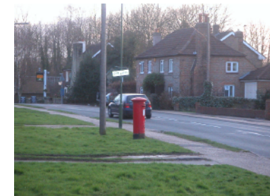
6. A mixture of styles and ages, the house in the foreground dates from the coming of the London to Portsmouth Direct Railway line.