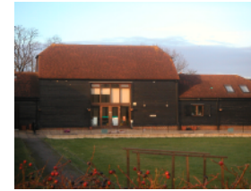
3. A reconstructed Tythe Barn providing a community resource for Holbrook.