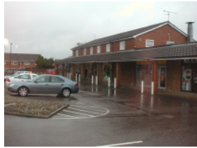
1. 1970 Shopping Parade with accommodation above serving the more southerly areas of Holbrook.

Can you identify the location of these ten photographs?